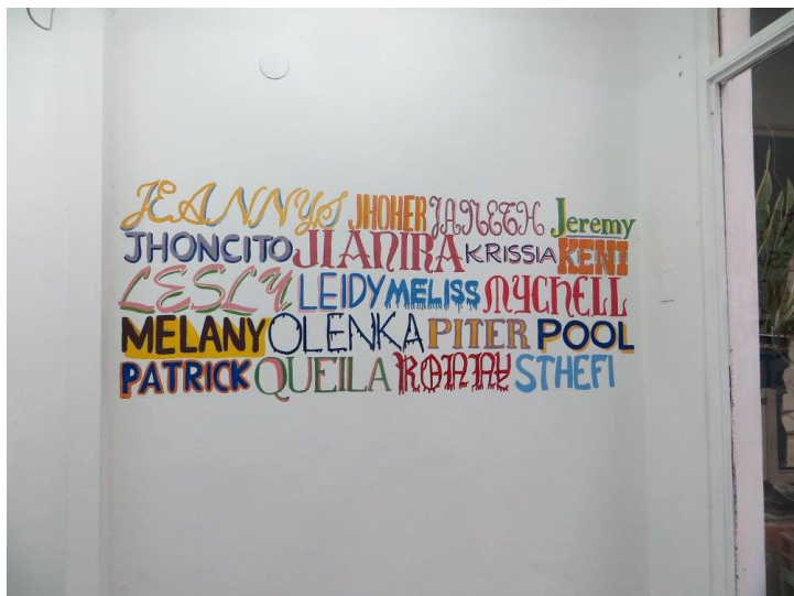
LIMAQ 100PRE - Eliana Otta's solo show at Museo La Ene, Buenos Aires, 2015

curator outfit today. But I don't usually wear it. There have to be many ways—we can't all look like black dress Barbies saying things like "I'm interested in everything, all lives matter." We can't all be that, thankfully.